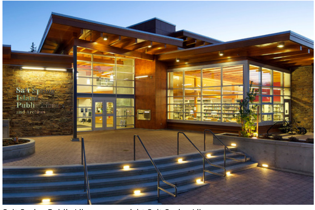
Salt Spring Public Library

Child & Youth Mental Health at SSI Community Services Society 250-537-9971