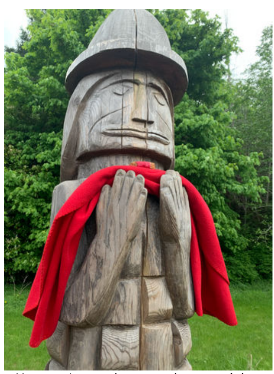
Xwaaqw'um welcome pole