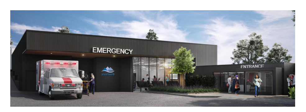
Lady Minto Hospital Emergency Department Redesign

Salt Spring has five family practice clinics, all located within ten minutes' drive of the hospital and Ganges Village, with a total of 17 general practitioners. Several local and visiting specialists also provide regular services at the hospital and host clinics. Most physicians hold hospital privileges and cover emergency room shifts. We have excellent midwifery care, and a thriving Home & Community Care program. Our public health clinic is in the heart of Ganges, providing neonatal care, breastfeeding clinics, harm reduction services, and immunizations. The Mental Health & Substance Use team maintains a good relationship with medical staff, working to provide wrap-around supports to patients in and out of hospital.